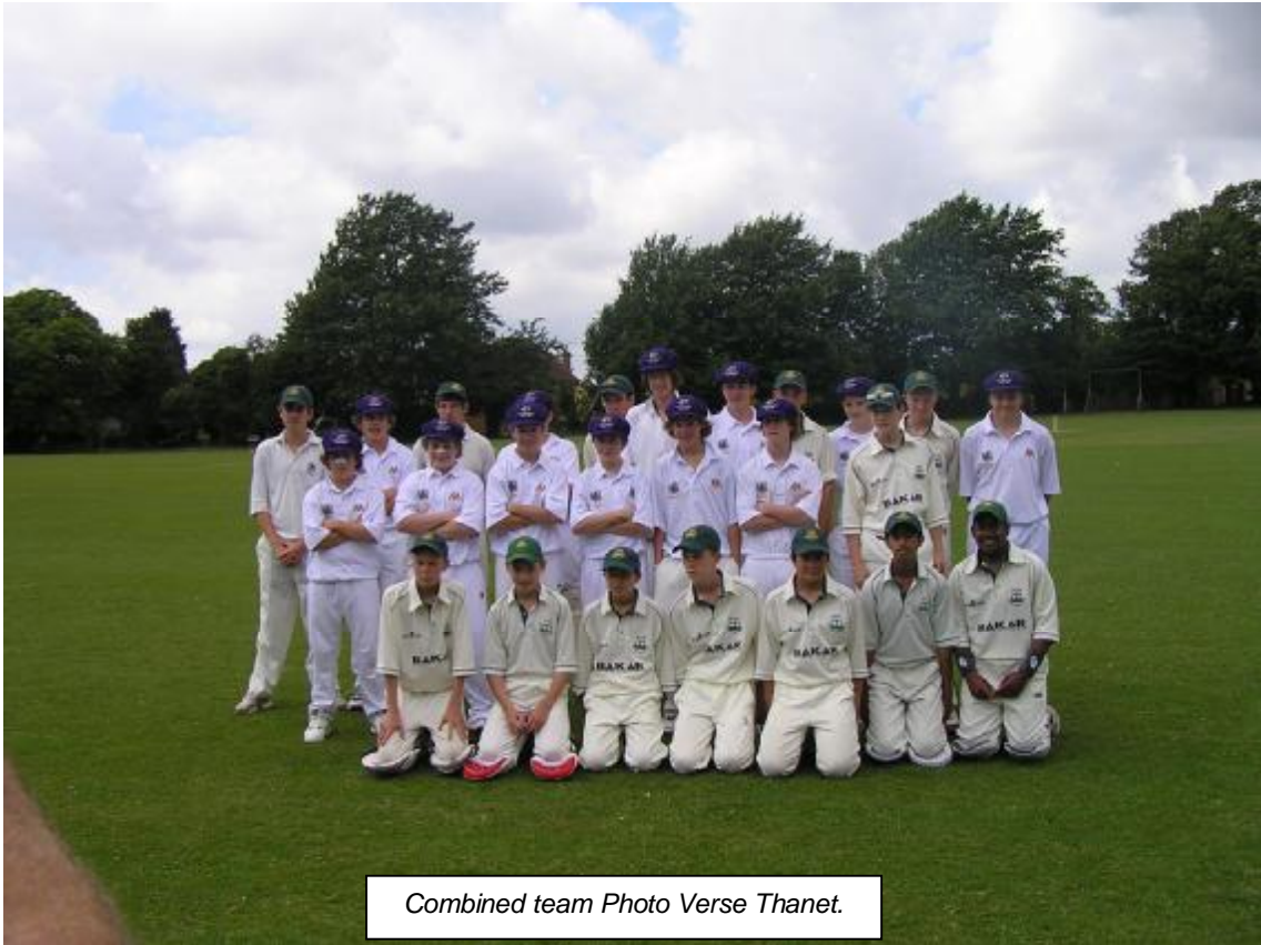
Combined team Photo Verse Thanet.