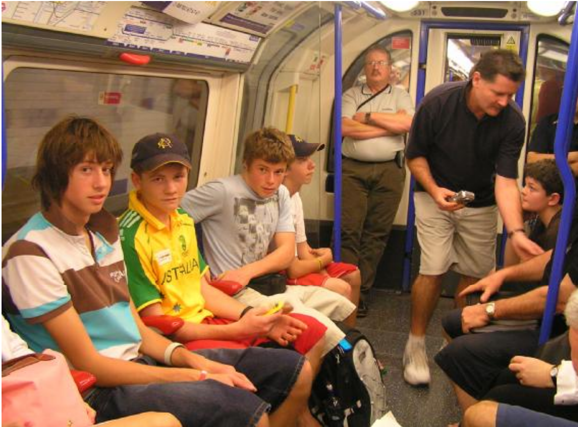
On the Underground going to Lords.