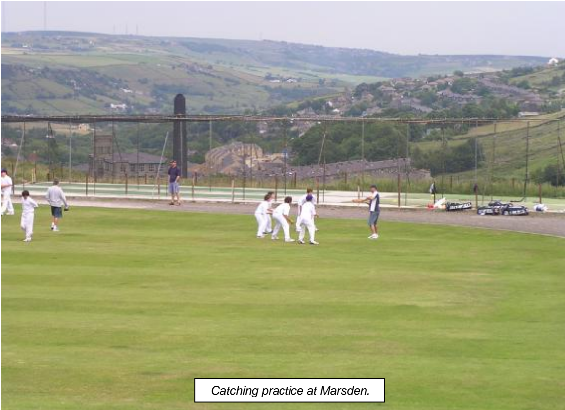
Catching practice at Marsden.