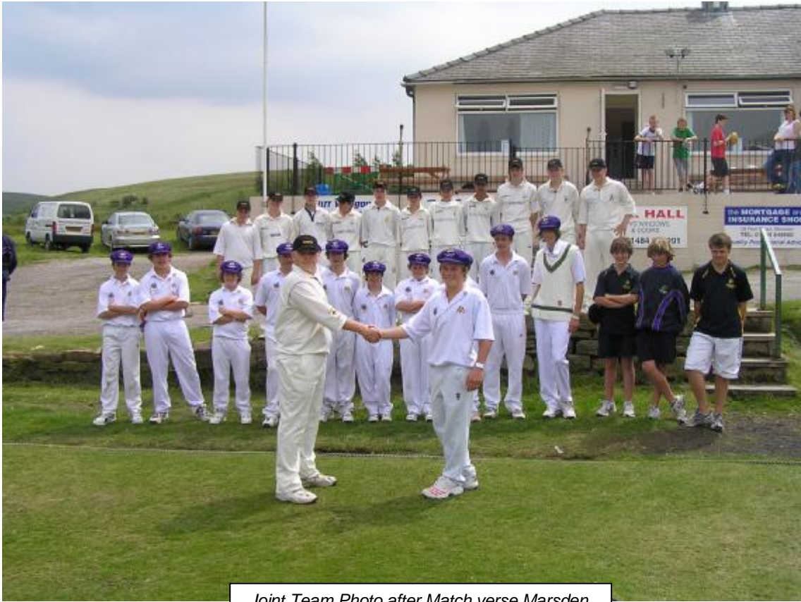
Joint Team Photo after Match verse Marsden.