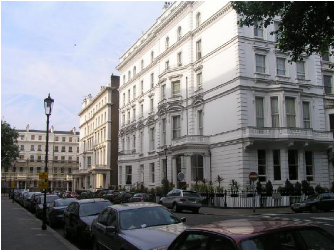
The Grange Hotel – Kensington.

On arrival in London we stayed in the Grange Hotel in Kensington