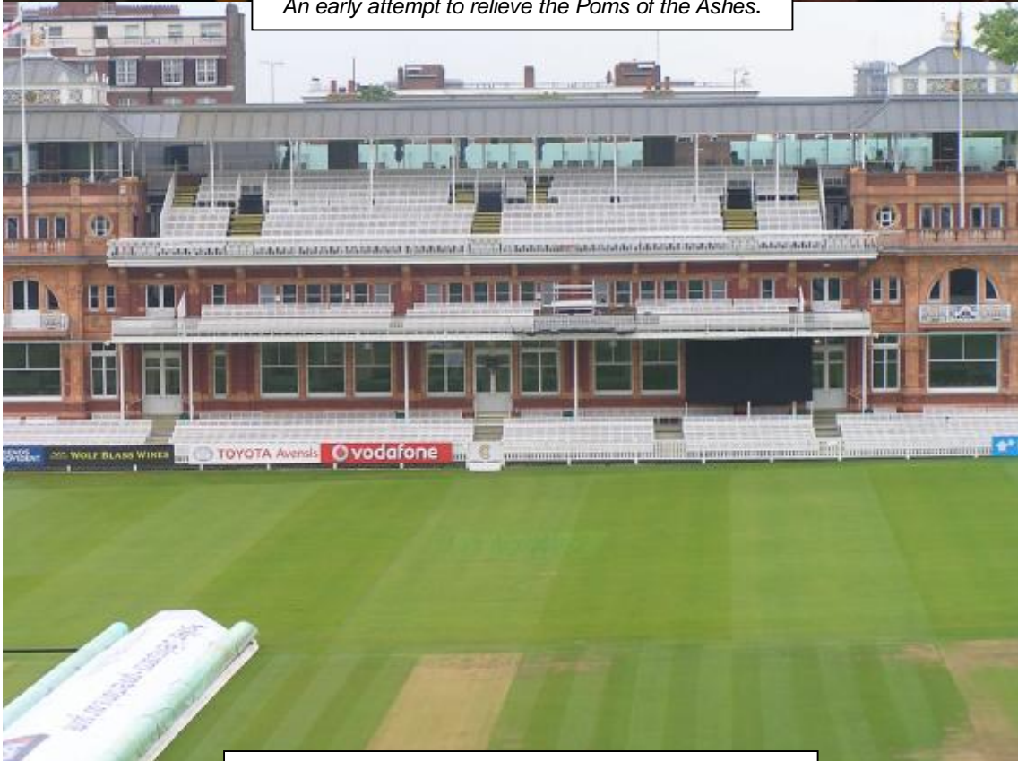
Lords looking back from inside the new Press Building.