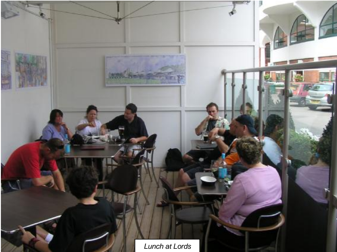
Lunch at Lords