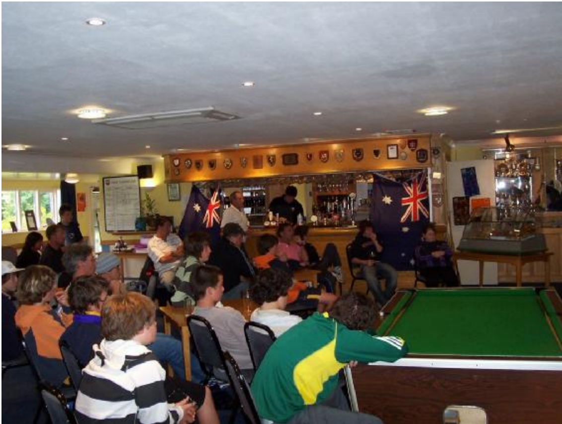
Watching the Soccer World Cup match Australia verse Italy at the Bath Cricket Club.

Washed out without even seeing the ground.