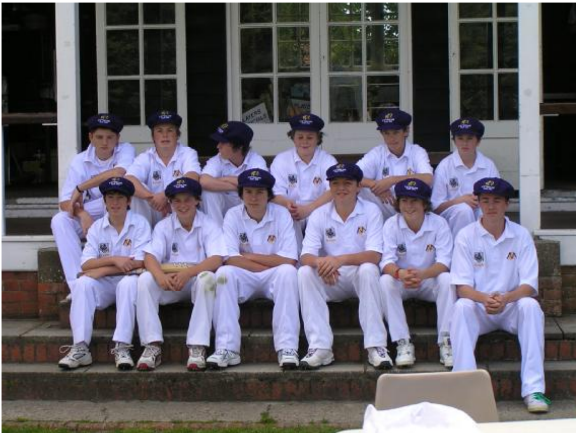
Team Photo verse Daunstey.