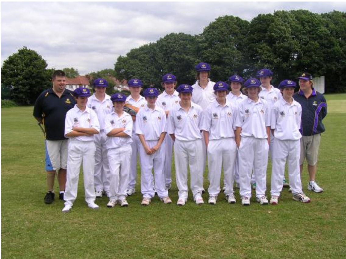
Team Photo after match verse London Schools.

A great team effort and fantastic start to the MPCA Under 15 2006 England Tour.