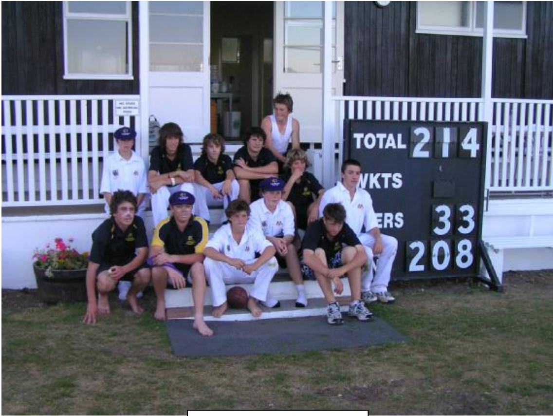
Team Photo verse Bryanston.