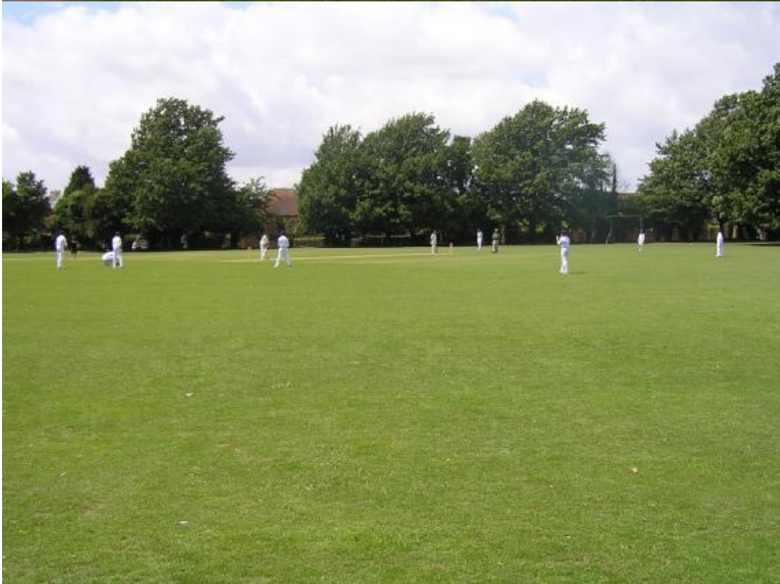
MPCA Verse Thanet.