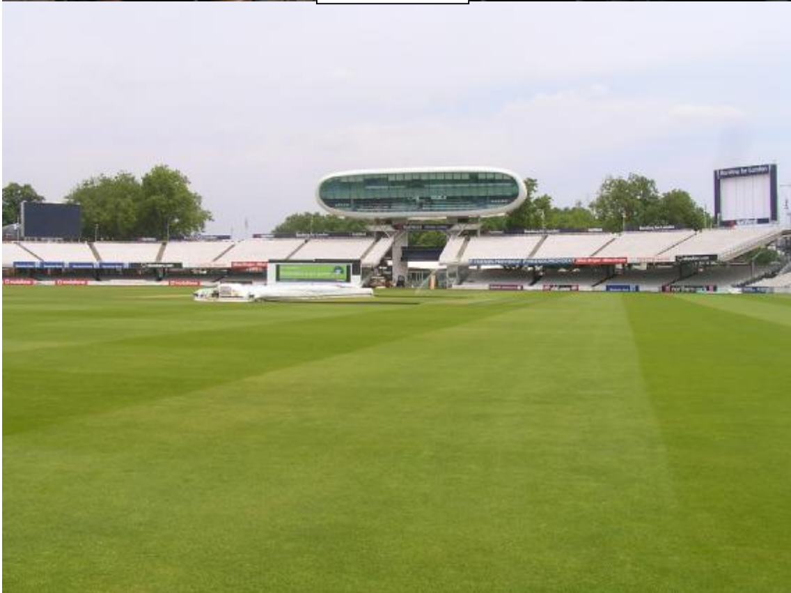
Lords; looking towards the new Press Building.