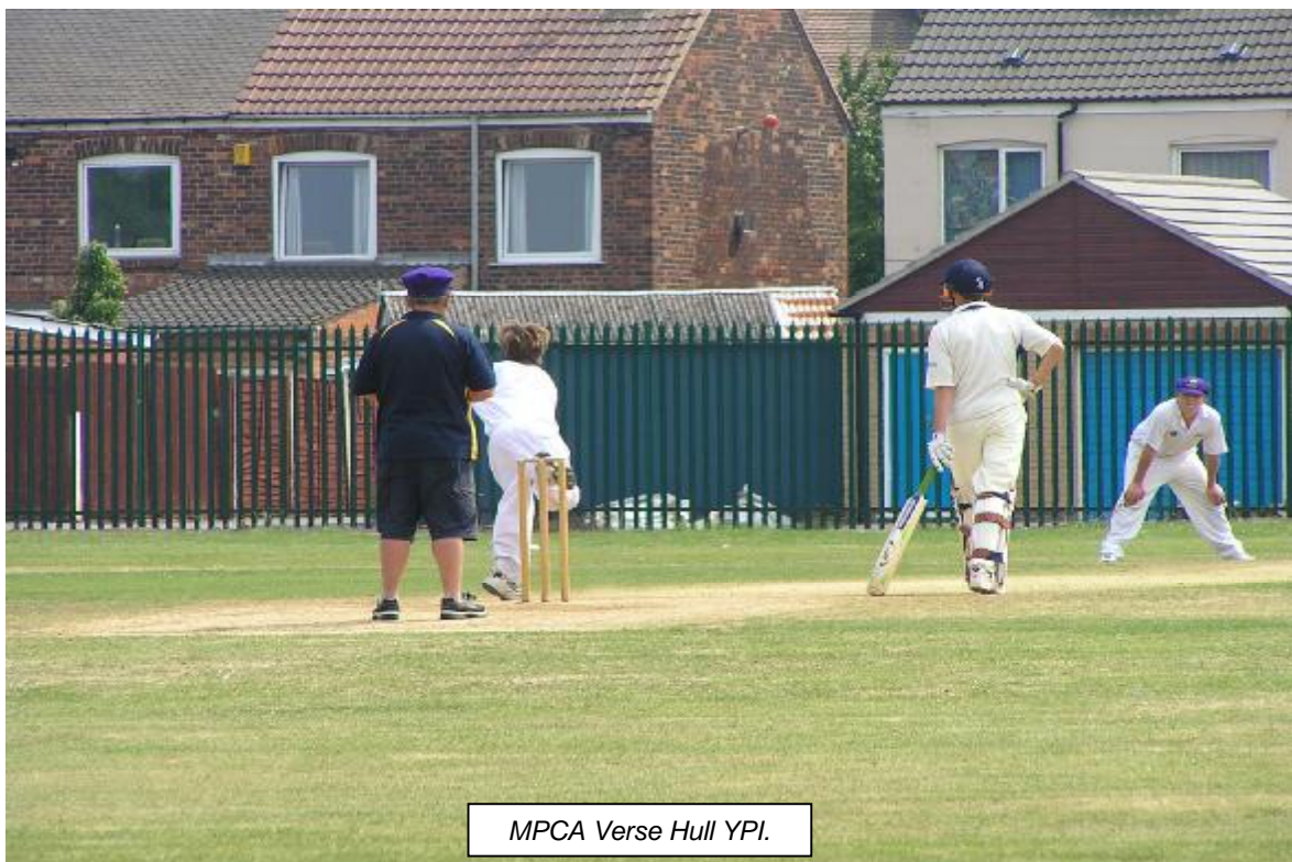
MPCA Verse Hull YPI.