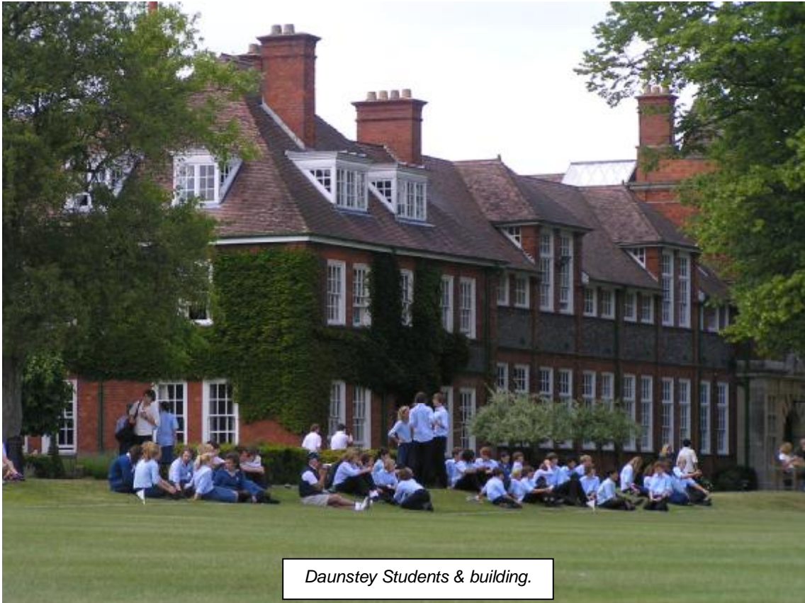
Daunstey Students & building.